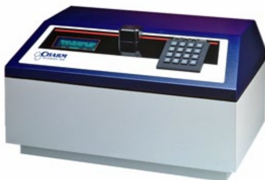
Charm II 7600 Analyzer