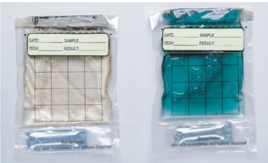
NEGATIVE No blue color