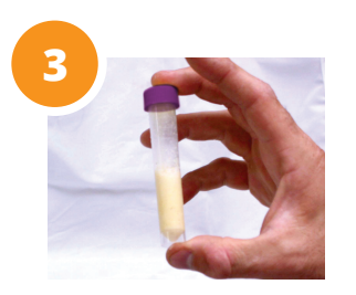
Shake and settle.