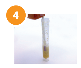
Add MycoTube strip.